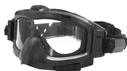
(A) Hit Kit Goggles