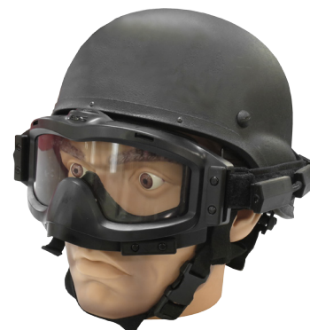
StressVest® Hit Kit Goggles SV-HSGOG-HK

The Stressvest Hit Kit Goggles are designed to work exclusively with the CQT laser. Primarily developed for SWAT and Military, this system allows users to conduct close quarter training without the need to wear the normal Stressvest panels that may cover equipment being worn by the user.