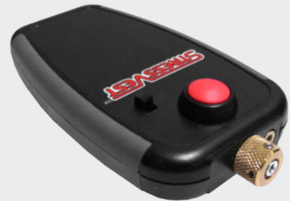
Hand Held Laser Activator SV-HHLA