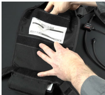
Hub Transmitter Cable