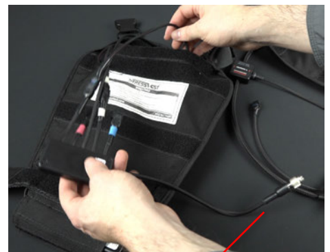
Hub Transmitter Cable